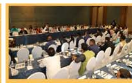
JBN PIONEER MEETING