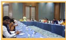
JBN VISIONER MEETING